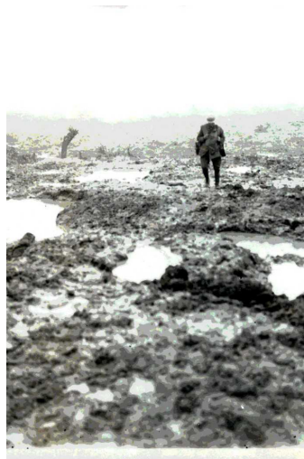
Touching the Bones with Phil Wisdom