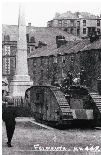
Opening Talk Falmouth History Archive